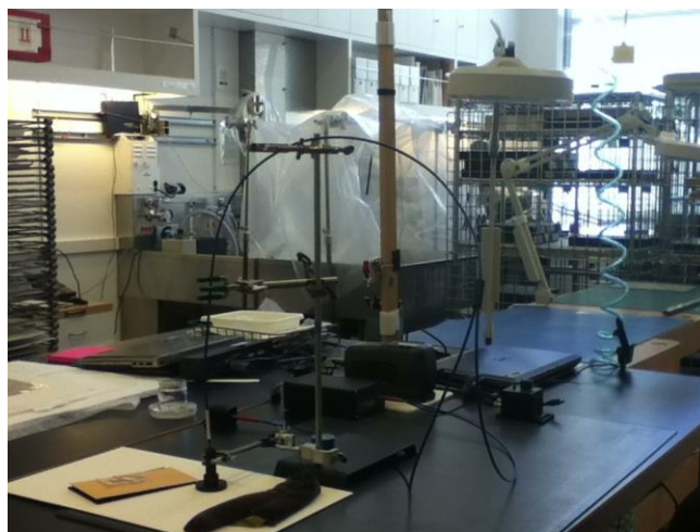
Conservation lab at the Getty Institute.