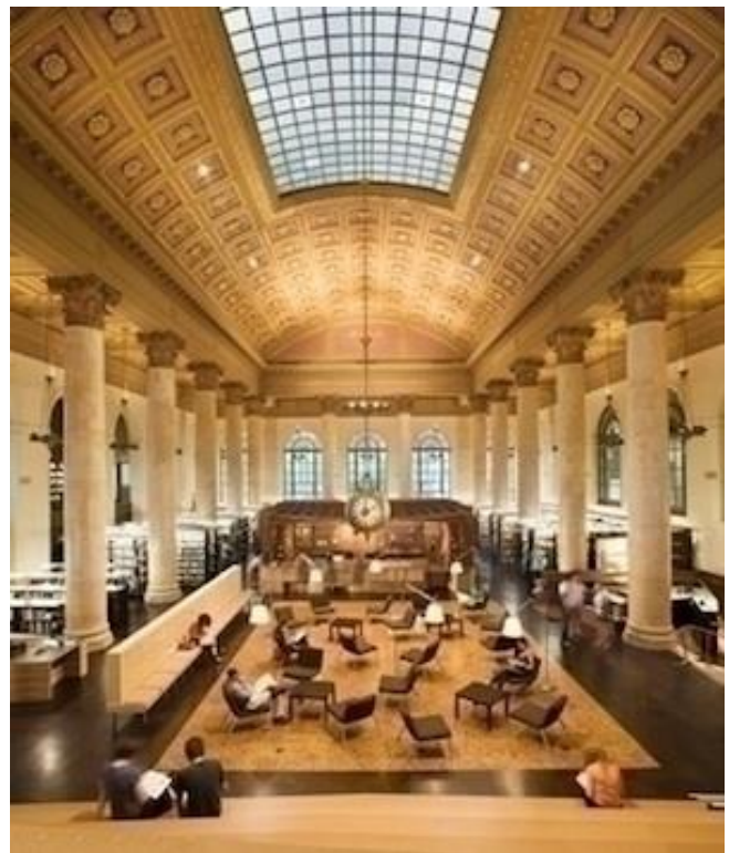
The Rhode Island School of Design's Fleet Library.

On Friday I served as one of three respondents in the Special Interest Group panel Ten Years and Counting: Building on the Past to Craft a Sustainable Future for the Summer Educational Institute for Visual Resources and Image Management . Lastly, as the incoming chair of the VRA Southeast Chapter, I attended the association's Leadership Breakfast on the final morning of the conference on Saturday.