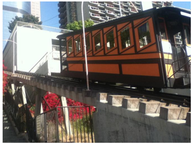
Angels Flight, the beginning of the downtown Los Angeles walking tour.