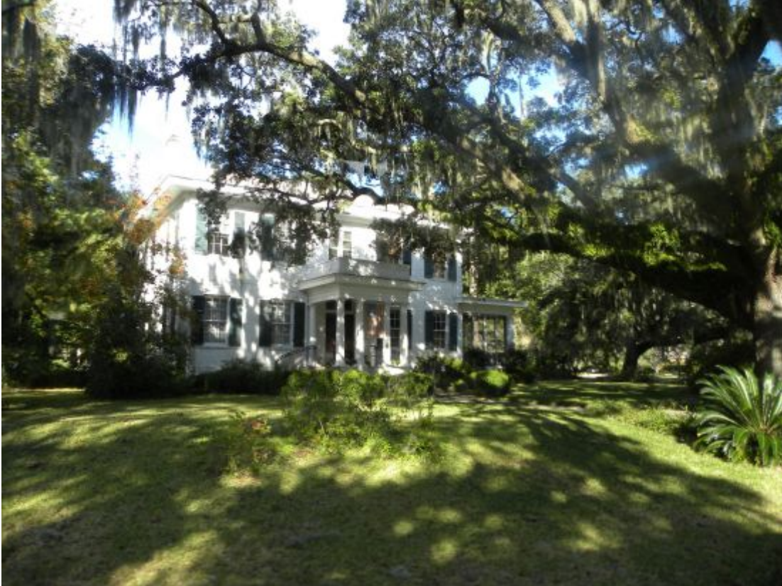
An example of beautiful residential architecture in Savannah.