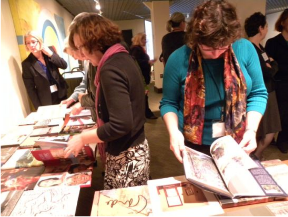
Conference goes peruse the entries for the LoPresti Award.