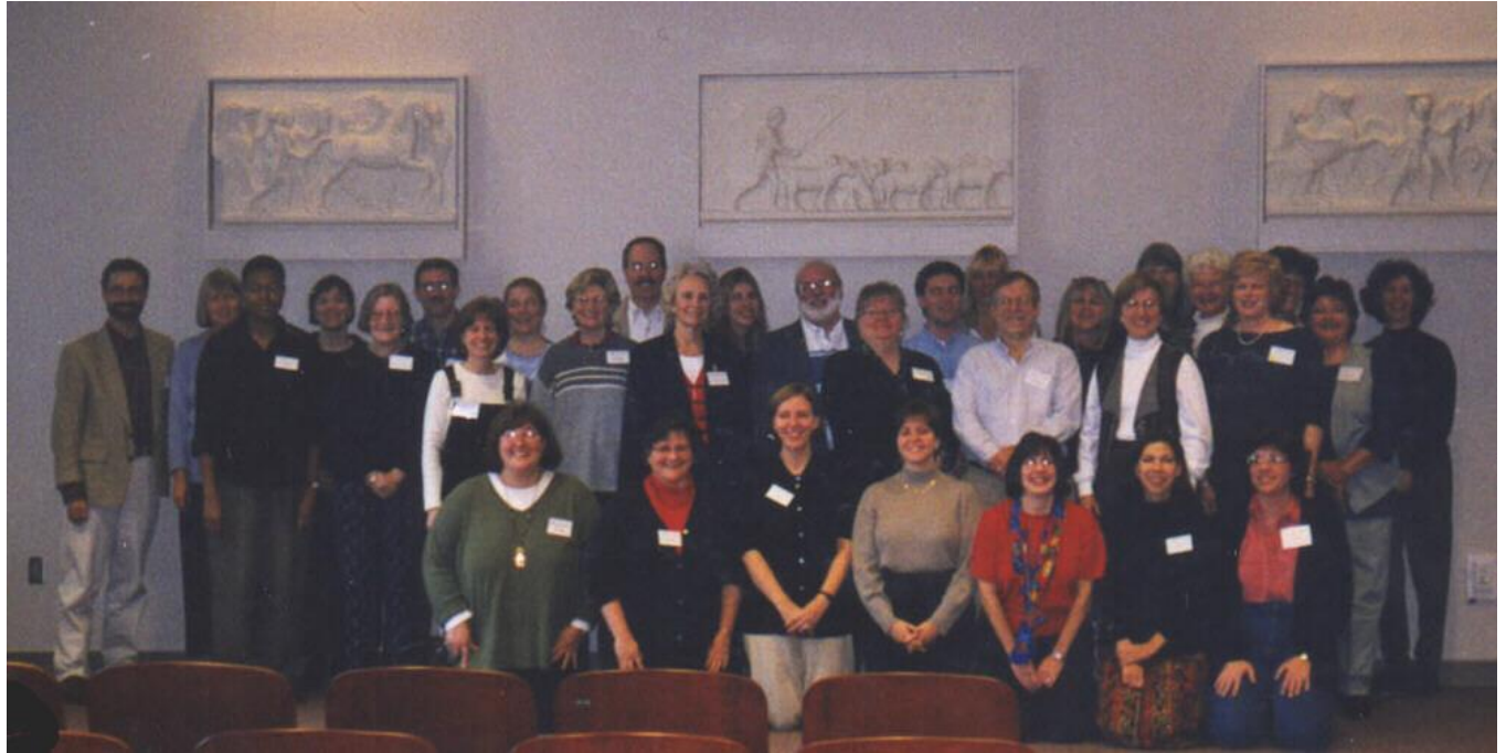
ARLIS/SE members at the 25th Anniversary conference membership meeting held at Emory University